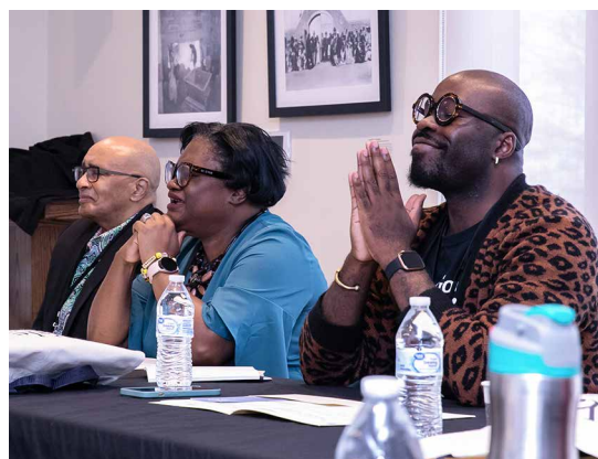
Participants in April's working group in Miller Hall