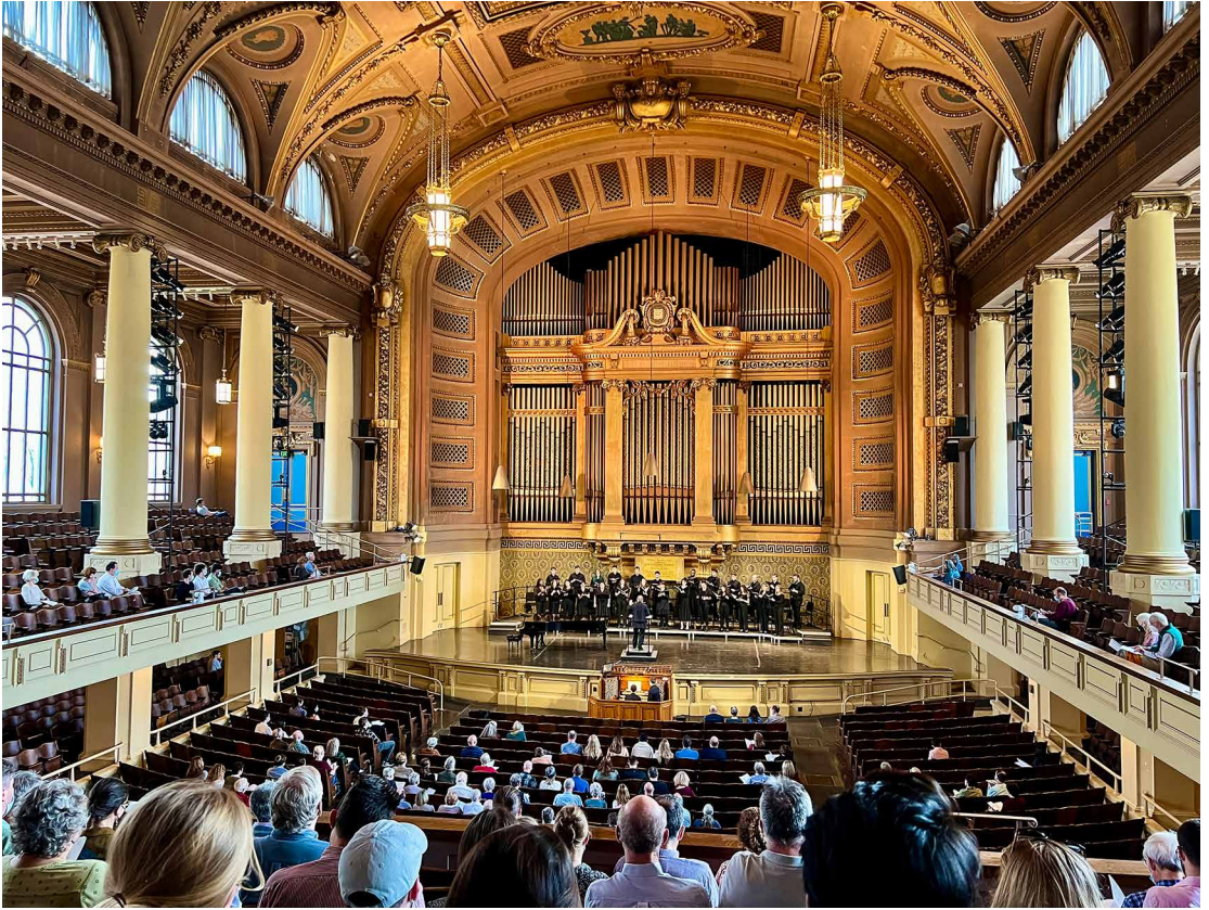
Yale Schola Cantorum performs “Music for All Souls” in Woolsey Hall.