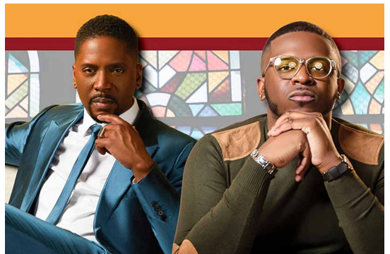
Donald Lawrence and Vincent Bohanan

On November 17, the ISM hosted “A Celebration of Gospel” featuring renowned gospel musicians Donald Lawrence and Vincent Bohanan. Together with their ensembles and a community choir drawn from the greater New Haven area, they performed at Immanuel Baptist Church in New Haven to a packed house, with a further 5,600 people watching via live stream.