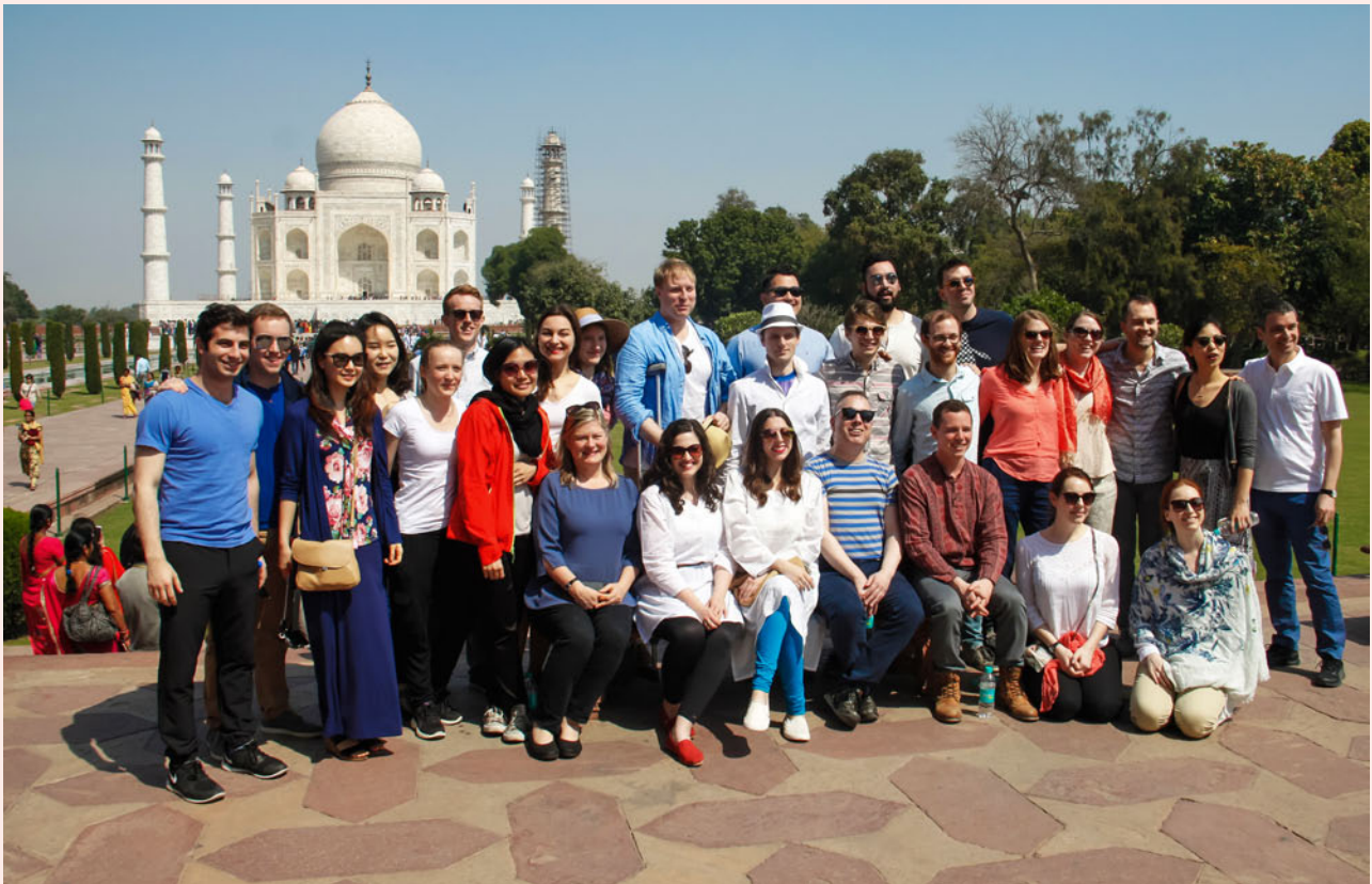
Schola at the Taj Mahal