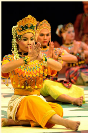
Mak Yong performers