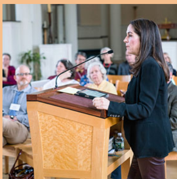
Keynote speaker Mary Karr