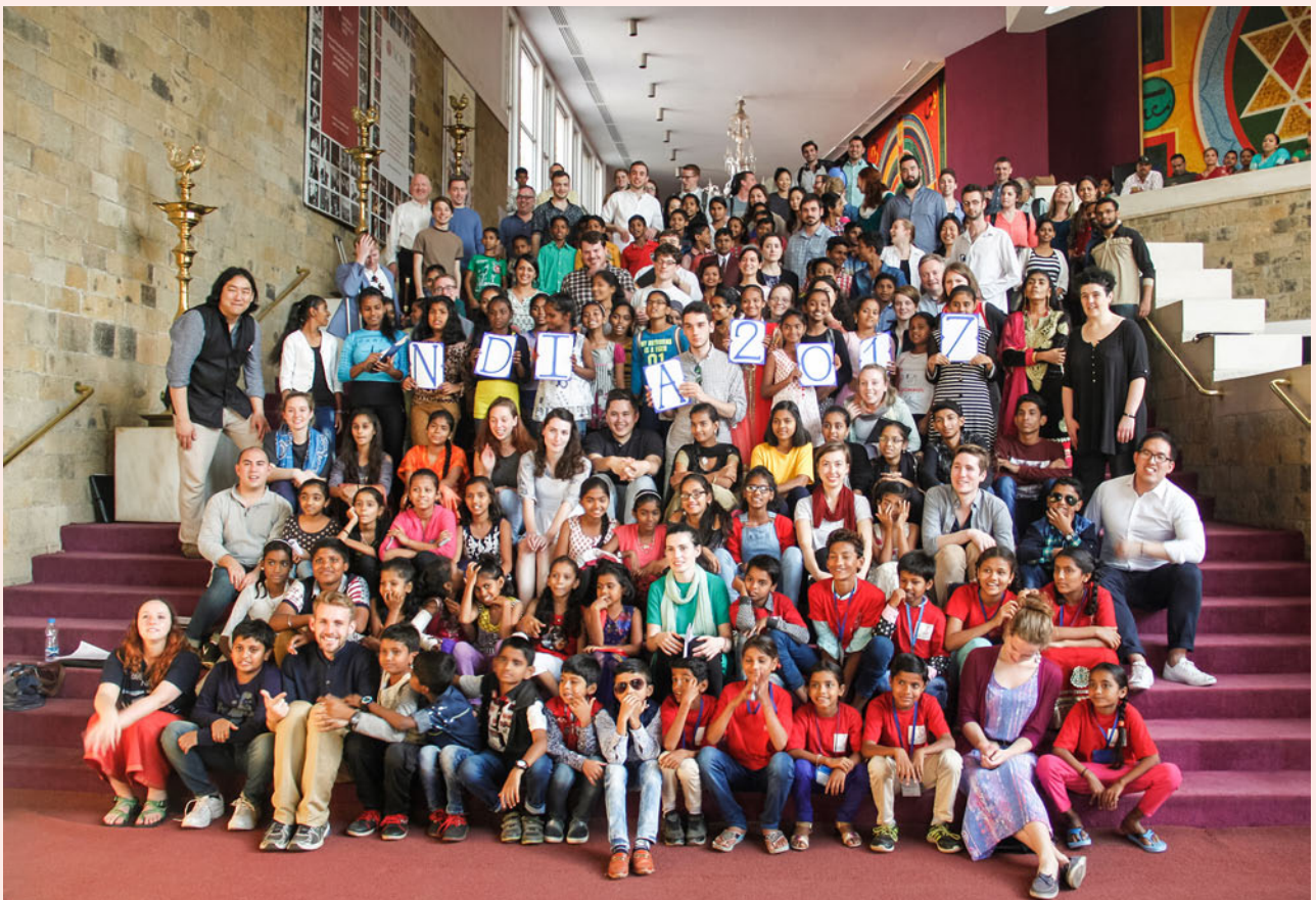
Visit with Songbound students and teachers