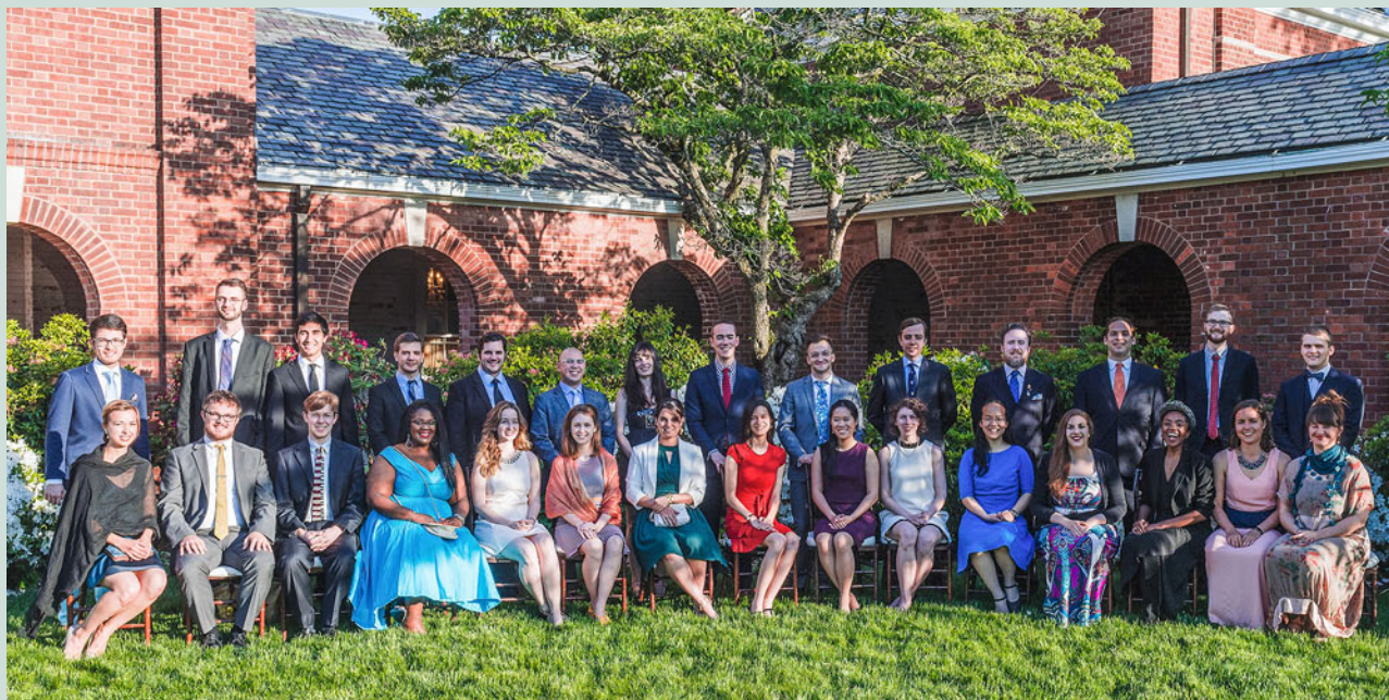
ISM Class of 2017