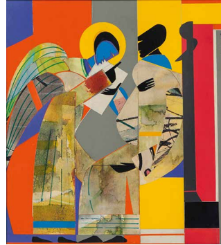
Romare Bearden The Annunciation , c.1974. 17" x 15"

© Romare Bearden Foundation / VAGA at Artists Rights Society (ARS), NY