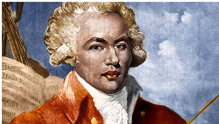
Joseph de Bologne