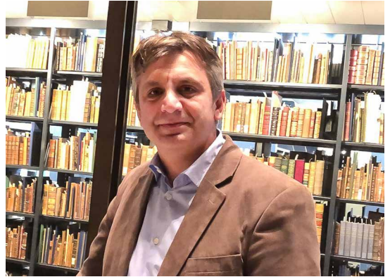
Working in the Divinity School Library