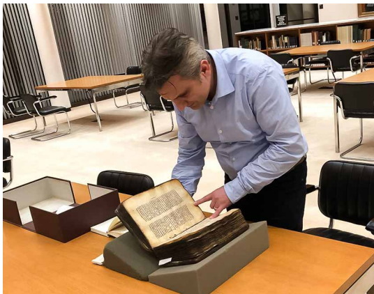
Working at the Beinecke Library

During my research visit, I was privileged to access several Syriac manuscripts in the Beinecke Rare Book & Manuscript Library, as well as other materials in the Divinity Library Special Collections. However, since there was no available catalogue, or even a general checklist, that documented all of the Syriac materials at Yale, I accessed all of the Syriac materials at Yale to make a comprehensive list of what was available. This was a necessary step to assist scholars and make a catalog available of the existing Syriac liturgical manuscripts in these collections. I hope that this will help scholars at Yale and beyond find sources for their research, teaching, and possibly future exhibitions.