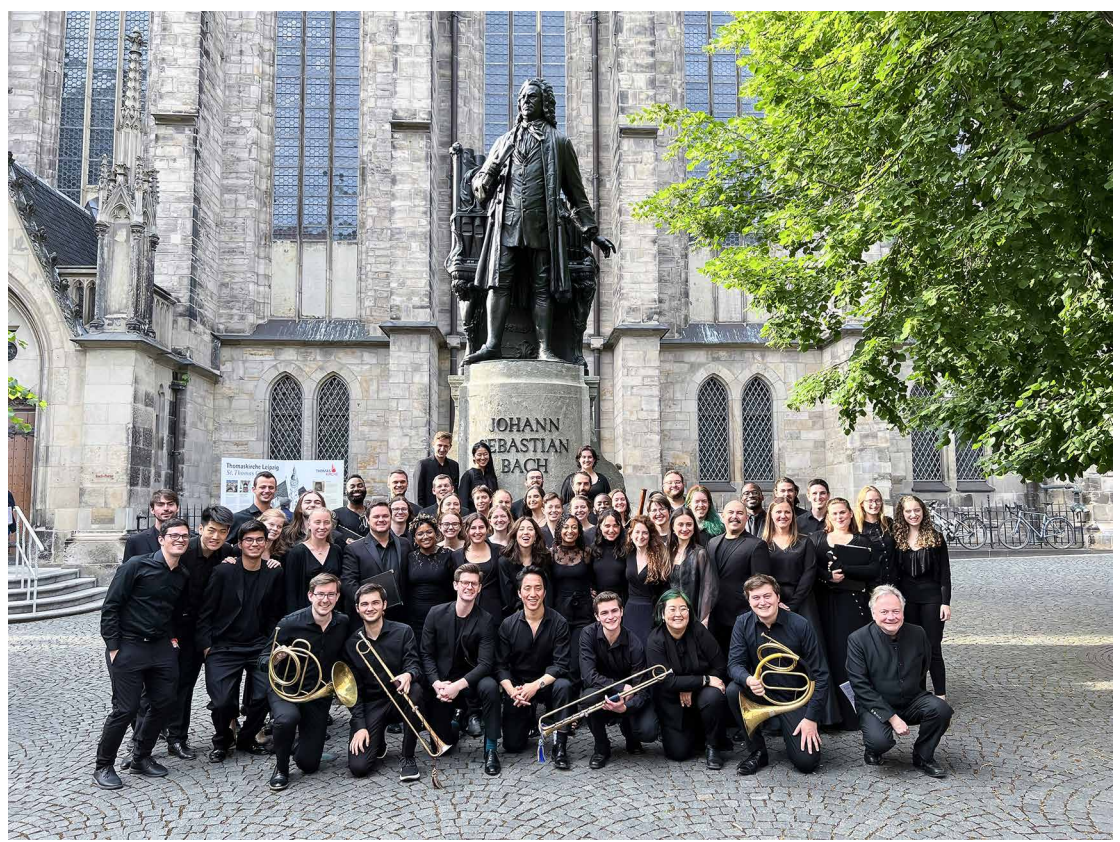
Outside Thomaskirche, Leipzig