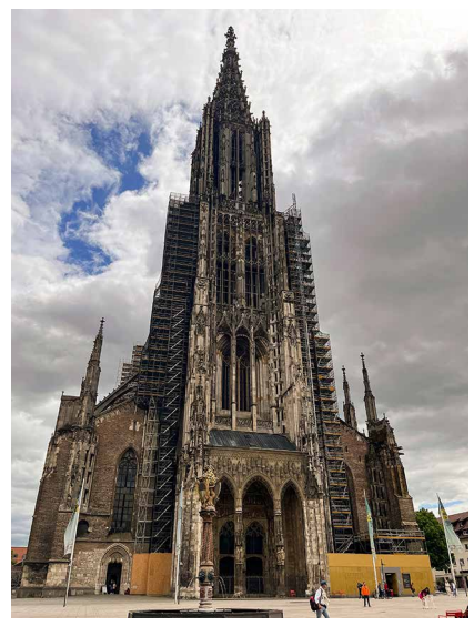
Ulmer Münster, Ulm, Germany