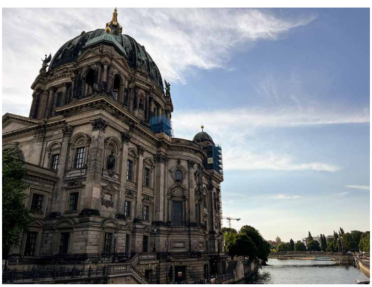
Berliner Dom in the evening, Berlin, Germany