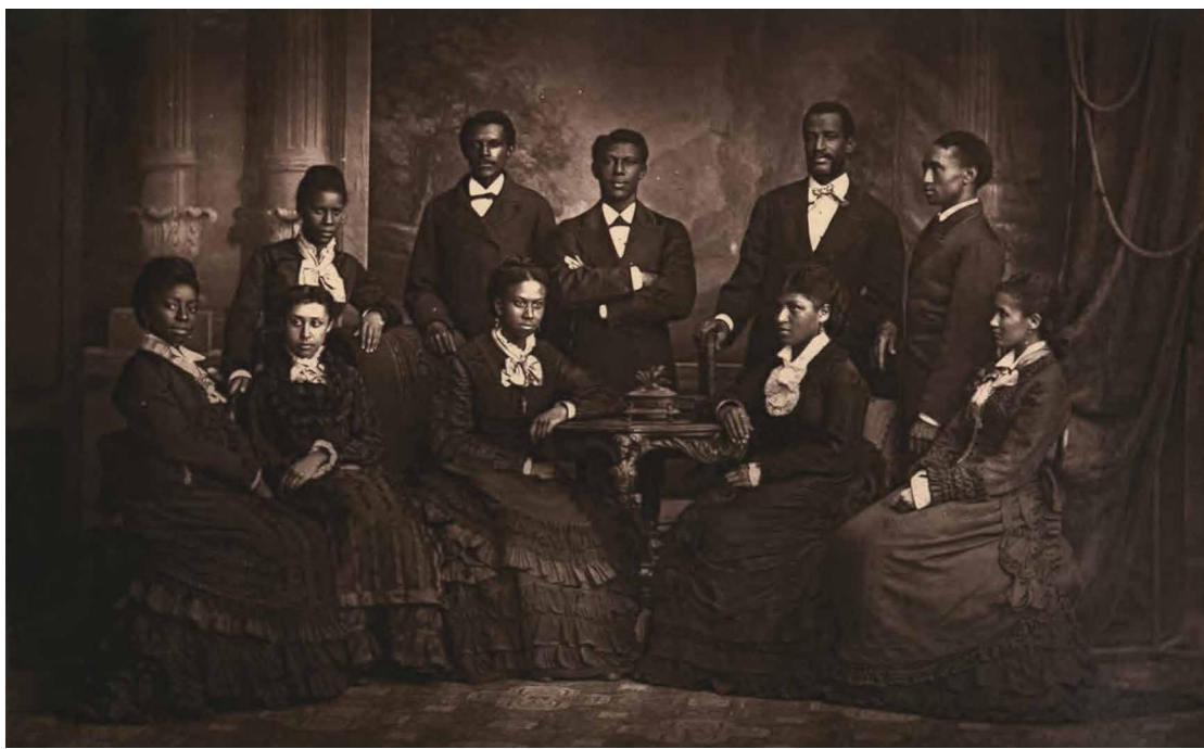
Jubilee Singers, 1877