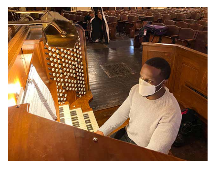
Backward Glances: ISM Memories