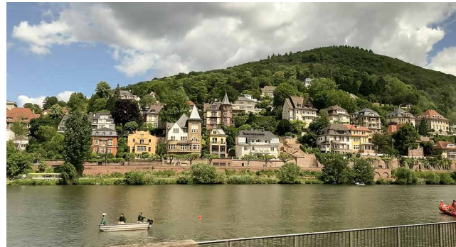
Neckar River, Heidelberg