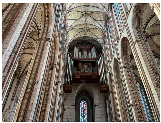
Kemper & Son Organ, Marienkirche, Lübeck, Germany