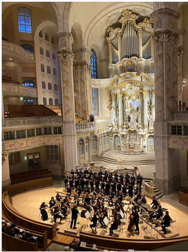
Performing in Frauenkirche, Dresden

As an encore, instrumentalists and singers alike joined in singing "A Prayer for Ukraine," composed by Mykola Lysenko with text by Oleksandr Konysky. Watch online a performance of this moving musical prayer for freedom and light, learning and knowledge, and kindness and grace for the Ukrainian refugees in attendance and everywhere.