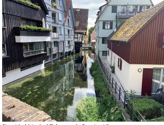
Street in historical Fisherman's Quarter, Ulm