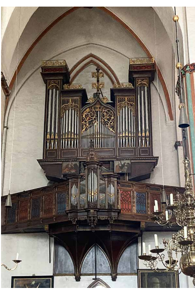
1637 Stellwagen Organ, Jakobikirche, Lübeck