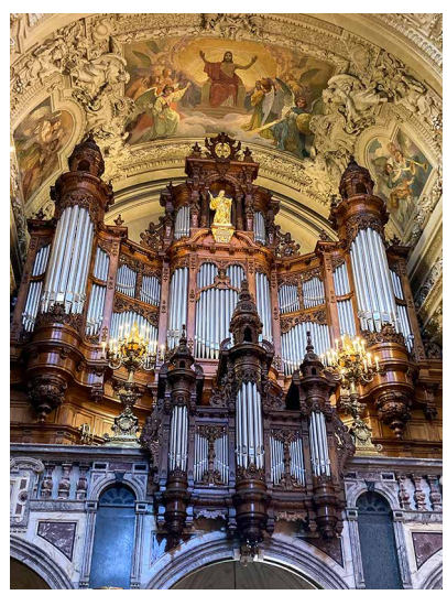
Berliner Dom Sauer Organ