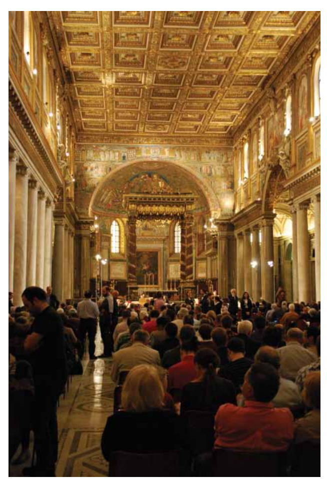
Audience gathers for the Schola performance at the Basilica Santa Maria Maggiore–Rome.