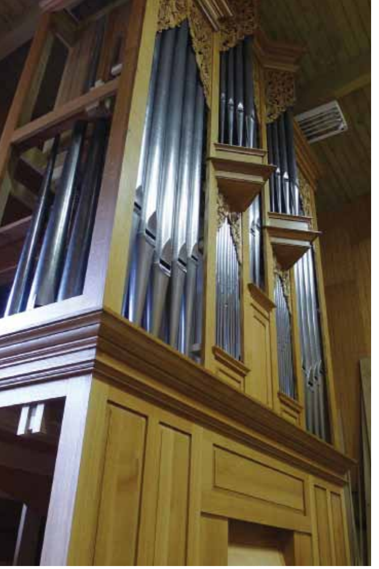
New organ for ISM organ studio by Pasi Organ Builders

First-year choral majors continue to conduct one major work in public each semester. Second-year majors conduct one full recital each year featuring one orchestral piece.