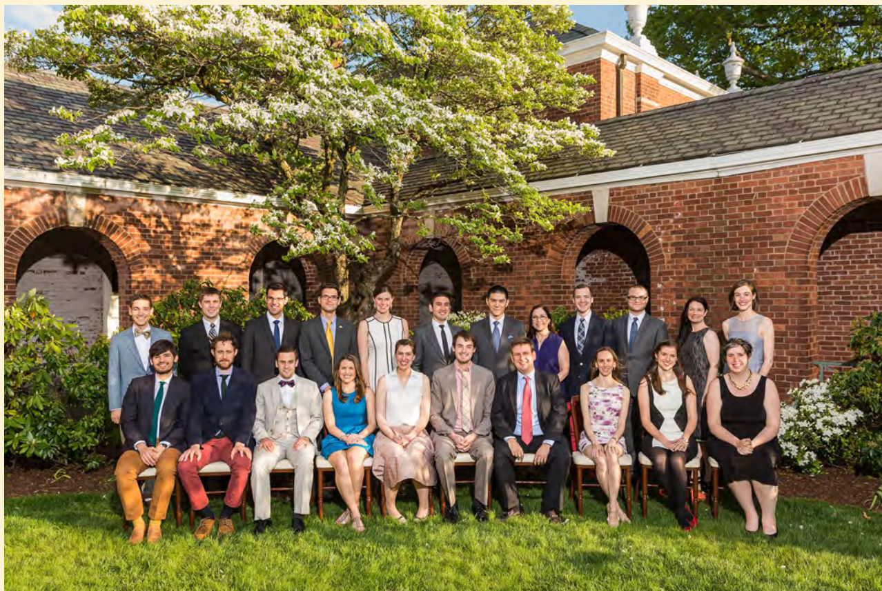
ISM Class of 2014