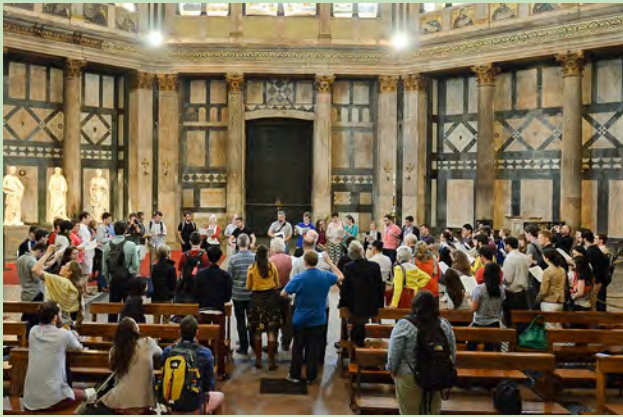
Singing in the Florence Baptistery

“Sicut cervus desiderat ad fontes aquarum, Ita desiderat anima mea te, Deus.”