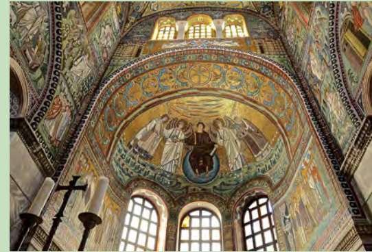
LEFT: 3 rd century Good Shepherd, Vatican Pio Christian Museum ABOVE: Duomo of Florence, Brunelleschi's dome TOP RIGHT: Church of San Vitale, Ravenna