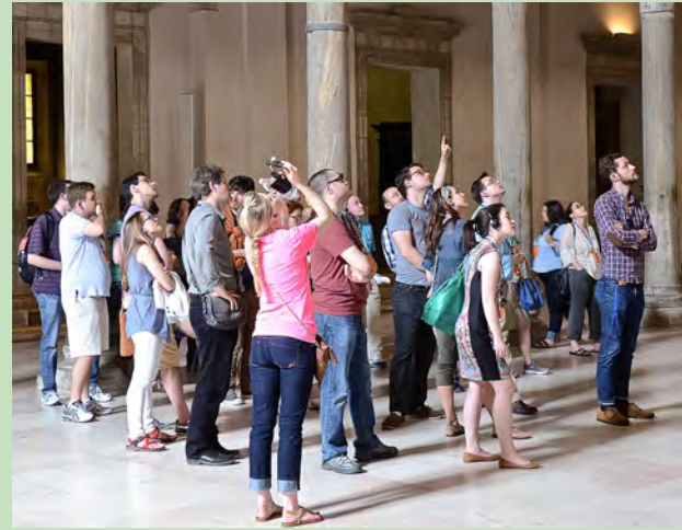
LEFT: View of Rome with Vatican in the foreground ABOVE: Students examining frescoes