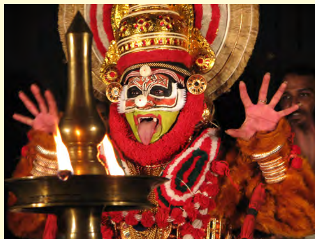
Nepathya in performance

Music of Monteverdi, Vivaldi, Gluck, Donaudy, Respighi and more