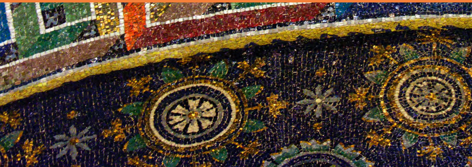
COVER ART: MOSAIC DETAIL FROM THE MAUSOLEUM OF GALLA PLACIDA, RAVENNA.