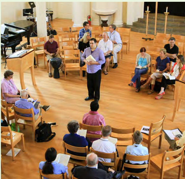
Preparing for a morning prayer service

Renewing worship, music, and the arts for the life of the world.