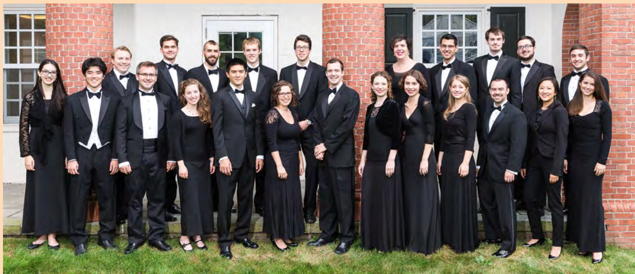
Yale Schola Cantorum