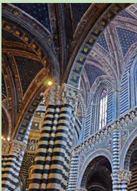
Siena Duomo detail

The Sienese cathedral’s baptistery lay in wait beneath the hard floor of its nave, making a little underground detour from our museum tour path necessary. In our haste to descend the stairs we had nearly shrugged off the small cross, embedded in the stone steps, marking the place where St. Catherine of Siena had fallen when tempted by the devil. Our attention was fixed squarely