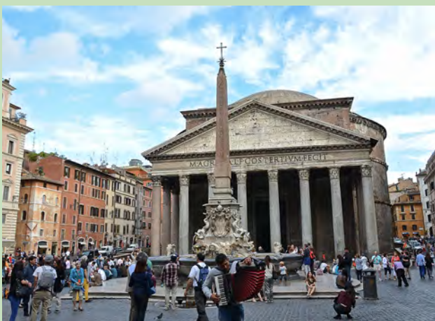
The Pantheon in Rome