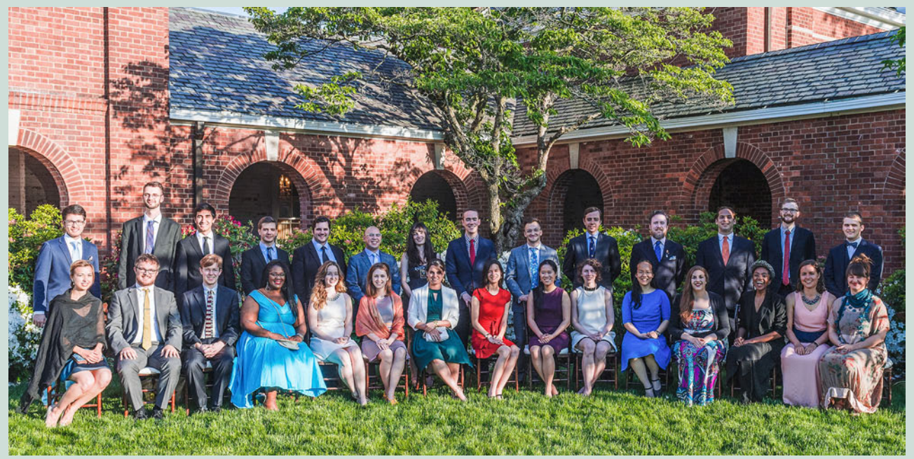
ISM Class of 2017