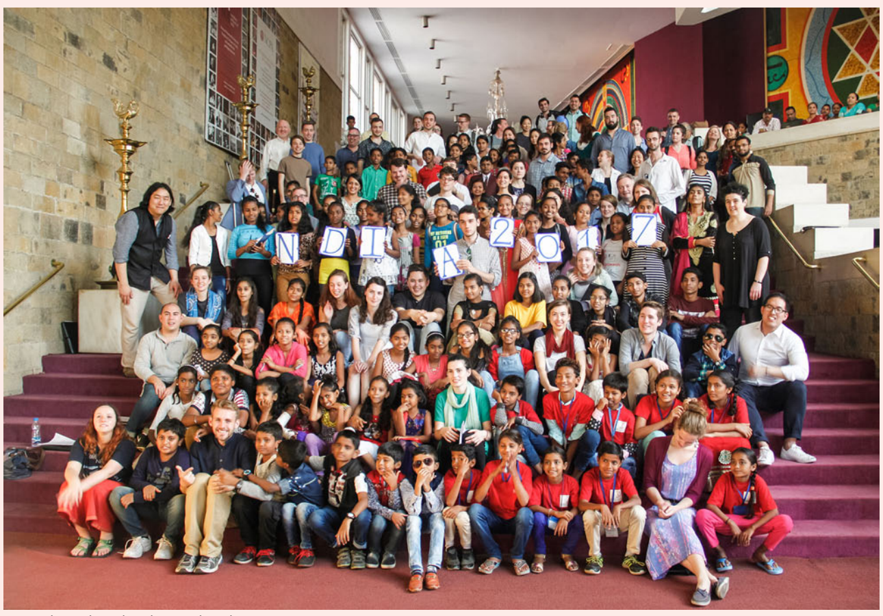
Visit with Songbound students and teachers