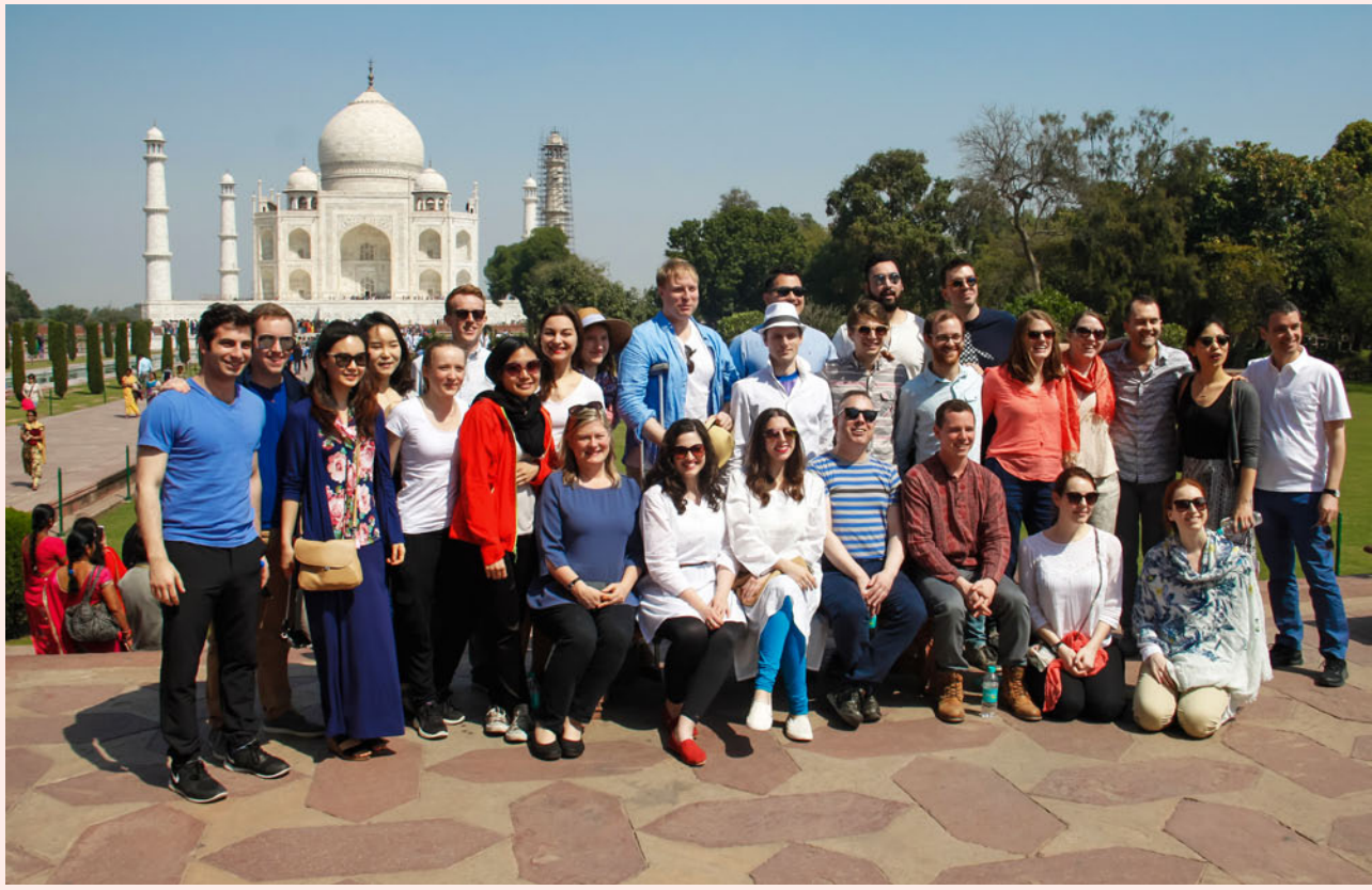
Schola at the Taj Mahal